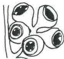
Eucalyptus tenuramis fruit

The Committee would like to wish all members a Merry Christmas, and best wishes for the New Year.