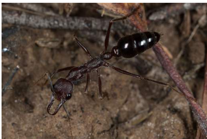
Inchman (or perhaps 25mm person??)

Chalcid wasp (not identified) Male Flower wasp Tiphidae Inchman Myrmecia forficata Tussock Moth Acyphas semiochrea cocoon and emerging caterpillars Cockroach Sp 2 Horned Treehopper Ceraon tasmaniae Gum Weevil Gonipterus sp Leaf beetle Monolepta subsuturalis Fireblight leaf beetle Peltoschema orphana Wingless Grasshopper Phaulacridium vittatum