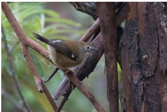
Scrub Tit seen after the walk on kunanyi/Mt Wellington.

have some differences to the Mt Wellington material so there may be more than one species involved. This genus has one species across the north of the state but several in the south. I had previously failed to find more around Junction Cabin so it was great that Abbey and I found a cluster of eight specimens on the Fingerpost Track.