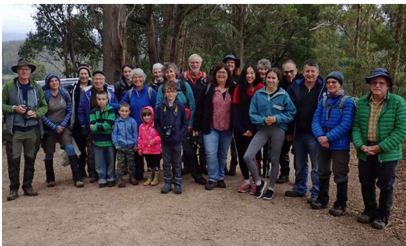
Easter Camp participants.