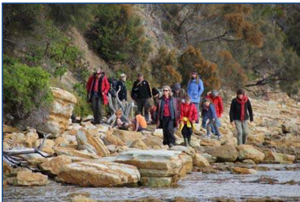
Exploring the Blackman's Bay foreshore.