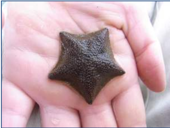
A starfish.

As we walked along we passed a small constructed pond in a gully, where I heard a brown tree frog Litoria ewingii . On the track I noted scratchings in the ground, which looked like those made by bandicoots, and scats of wallabies, possums and dogs. The cool, cloudy conditions