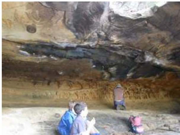
"They found a cave...."