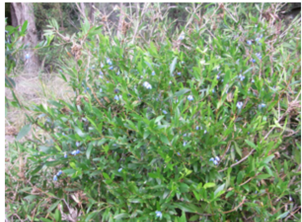
The weed Solya very out of place on the foreshore.

There were plenty of insects around. Mike identified a disappearing grasshopper Schizobothrus flavovittatus , to a chorus of "Where is it? Where is it?" from bystanders, and a common macrotona Macrotona australis .