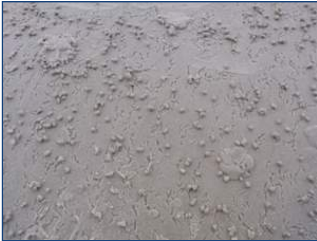
Crab tracks.