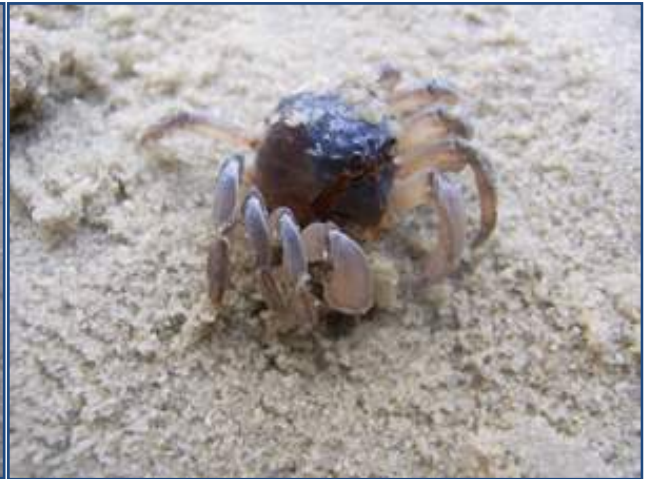
Blue crab. Photo Andrew Hingston