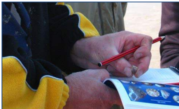
First find the shell.....