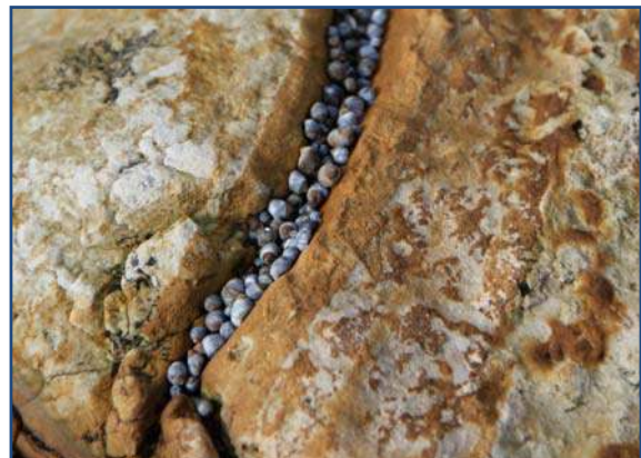
crevice filled with Nodilittorina unifasciata.

A total of twenty-eight members turned up for the outing despite the cool weather and the possibility of rain. We were pleasantly surprised to be bathed in sunshine.