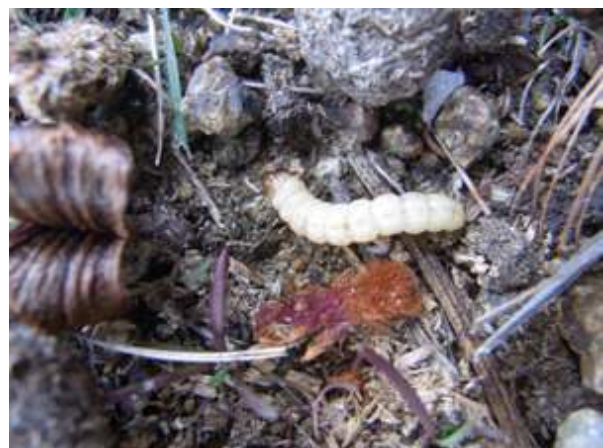
Banksia larvae.

Apart from one area of stormwater runoff, there were few weeds present. The stormwater outlet was infested with watsonia Watsonia meriana , and also supported agapanthus Agapanthus