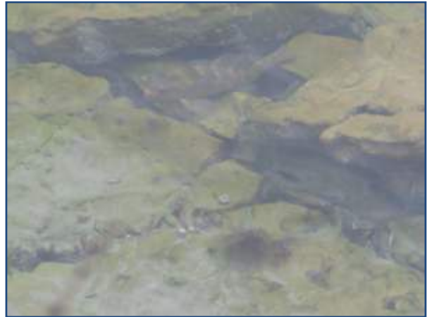
Fish swimming in water.

were ideal for bird activity. The species identified included eastern spinebill, crescent honeyeater, yellow-throated honeyeater, silveryeye, spotted pardalote, scarlet robin, brown thornbill, grey fantail, grey shrike-thrush, grey butcherbird, pied oystercatcher, white-faced heron, black-faced cormorant, Pacific gull, and a white-breasted sea eagle spotted by Geoff and Janet after most people had left.