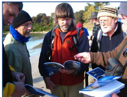
... then consult the comprehensive guide.