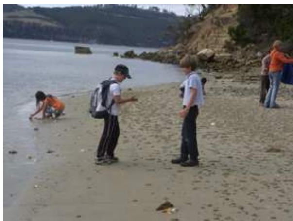
Meandering along the beach.

Apart from one area of stormwater runoff, there were few weeds present. The stormwater outlet was infested with watsonia Watsonia meriana , and also supported agapanthus Agapanthus