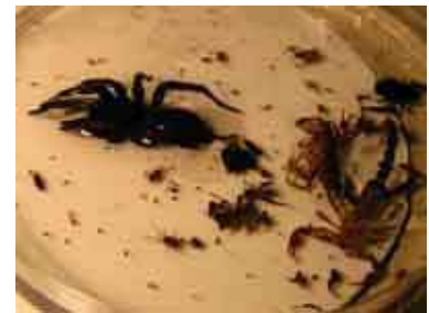
An assortment of goodies

A small and very pretty frog drew a small crowd of admirers, and was especially popular with the children. Plenty of scorpions were found and easily identified as there is only one species in Tasmania.