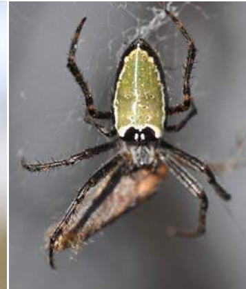
Fig. 3 Araneus bradleyi jade form

The survey also provided my first encounter with Argiope trifasciata (figs. 4-6), a 17 mm female banded orb weaver which shared the same control site as the diverse enamelled spiders. A. trifasciata 's body is brownish but is totally covered by dense white hairs. Its relative, the St Andrew's Cross spider, Argiope keyserlingi , builds a stabilimentum forming a cross in the centre of its web, unlike A. trifasciat .