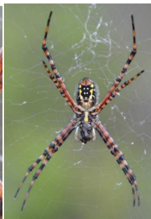
Fig. 6 Argiope trifasciata ventral