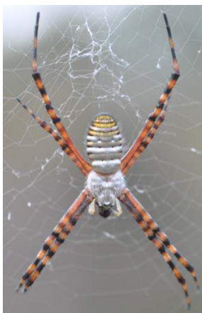
Fig. 4 Argiope trifasciata dorsal

A. trifasciata is also native to Queensland and Western Australia as well as America and South Pacific islands. The species is not harmful to humans but a series of argiotoxins extracted from its venom (used to subdue prey) are being explored to block neurotransmitters by blocking glutamate receptors to treat dementia, epilepsy and so on.