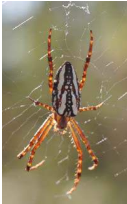
Fig. 1 Araneus bradleyi white form

Apart from variations in patterning of the white form, the yellow form was particularly bright (fig 2) while the jade form (fig 3) was so cryptic it was difficult to believe it was the same species. The spiders feed on small flying insects trapped in their webs and are found in the eastern Australian States.