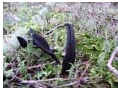
Earth Tongue, a club fungus

Target species have been chosen by Fungimap mycologists to be easily identified in the field, and may be common or rare, native or introduced.