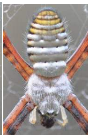
Fig. 5 Argiope trifasciata dorsal