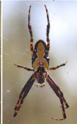
Fig. 2 Araneus bradleyi yellow form