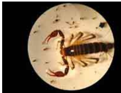
Scorpion & mites