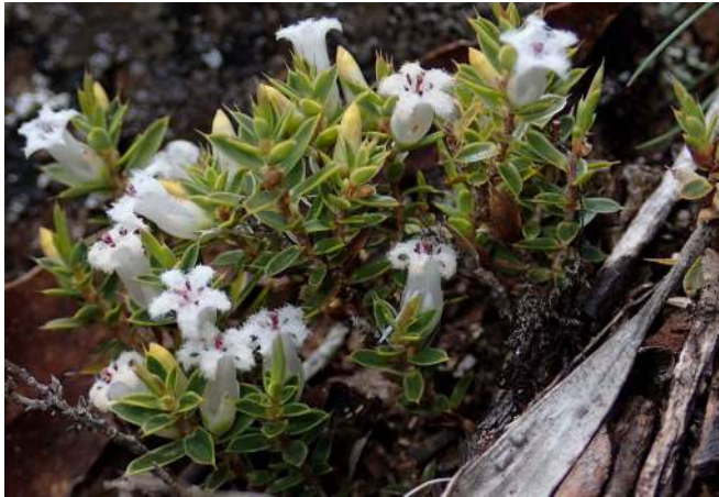
Leucopogon fraseri