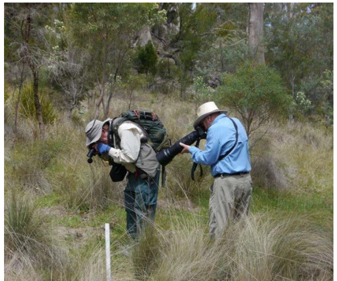
Field Nats pursue a photographic interest

As well as being an excellent display of native plants, the garden has picnic and bbq facilities, and so was a most suitable venue for a field nats gathering. As we entered the garden, members were immediately struck by the number of insects feeding on the flowering shrubs, and so progress to the bbq shelter further up the hill was slow!