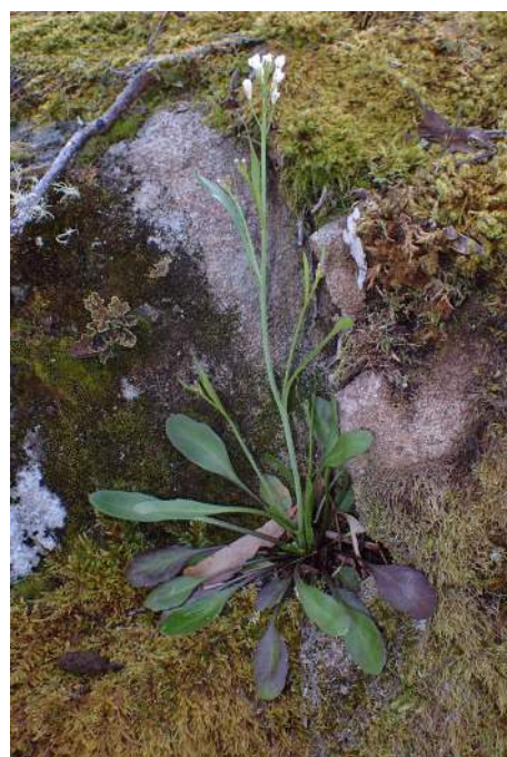
Cardamine tryssa

During the walk there was plenty of evidence of wombats and of grazing by red-necked wallabies and the feral fallow deer. A herd of over 50 Fallow deer was sighted on the drive from Miena to the Steppes Homestead.