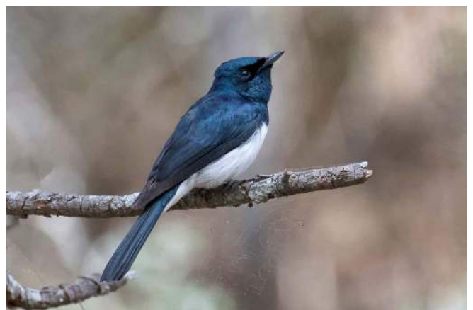
Male Satin Flycatcher

As the clouds cleared and the afternoon warmed up, the activity and numbers of nectar-feeding insects increased, providing ample engagement for the macro-photography enthusiasts. The other objects of interest, and of photographic opportunities, are the metal sculptures situated around the gardens, and other wildlife of the flesh and blood kind - frogs were calling in the pond, many skinks and a solitary blue-tongue lizard were seen basking in the sun.