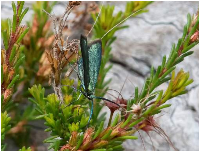
An iridescent moth