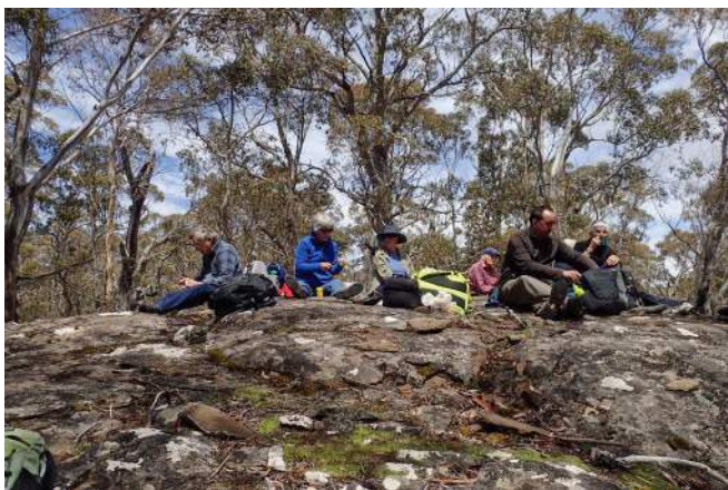
Steppes lunch time rock

James set off into the bush, as the crow flies, following his GPS reading for Cardamine tryssa with many of us all trailing and flailing behind, but after consultation we regrouped and following Anne and Ken's previously marked trail we all arrived safely up at the rock outcrops on the Steppes State Reserve, where we enjoyed our lunch.