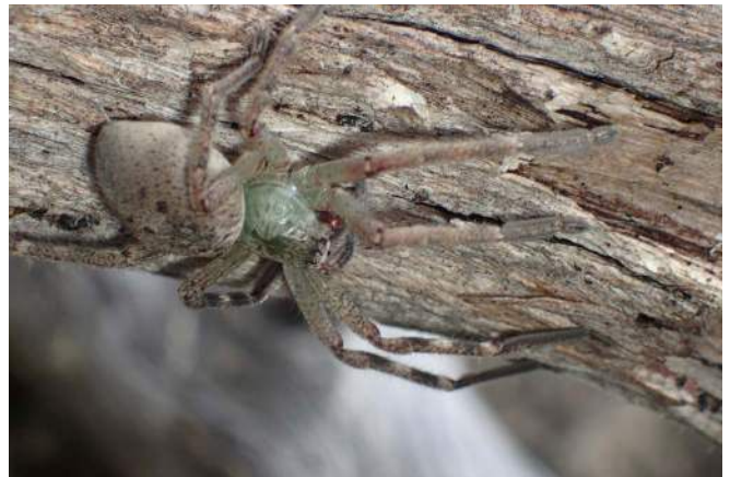
Neosparassus patellatus - Huntsman