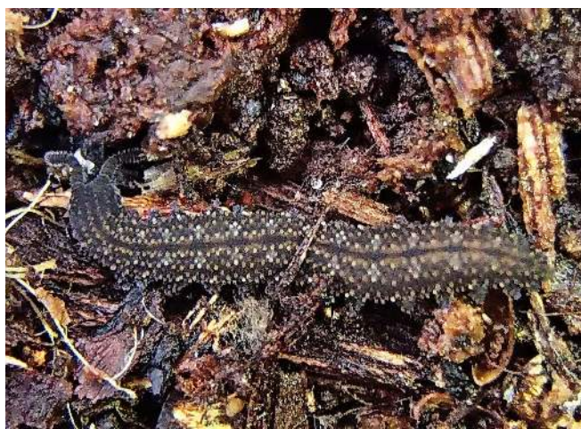
Velvet worm.

The Club members who decided to spend the weekend up on the Central Plateau and do a little field naturalising along the Poatina Road on Saturday en route for the excursion the next day, were not disappointed when they saw a number of echidnas and of particular note they found a Gondwanaland species - Velvet worm or Peripatus. Further finds from that day are listed at the end of this report.