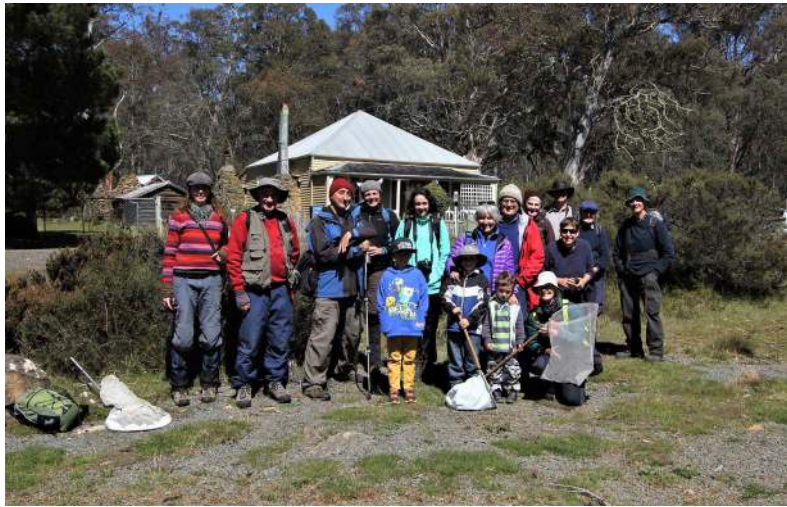
Field Nats at The Steppes Excursion, November 5th.