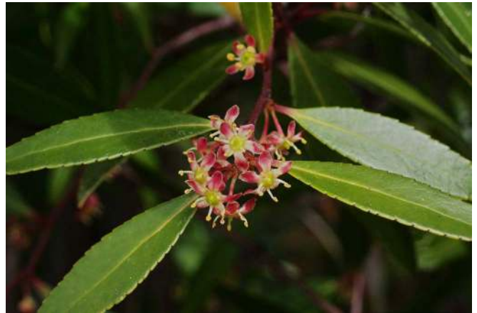
Maytenus boaria