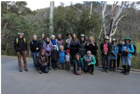
The group at start of walk

On Saturday 8th October 2016 a group of 21 Field Nats set off from Pottery Road in Lenah Valley to head up towards Noah's Saddle in search of orchids. In particular we were seeking Pheladenia deformis (Blue Fairy) which had been found in the area in previous weeks.