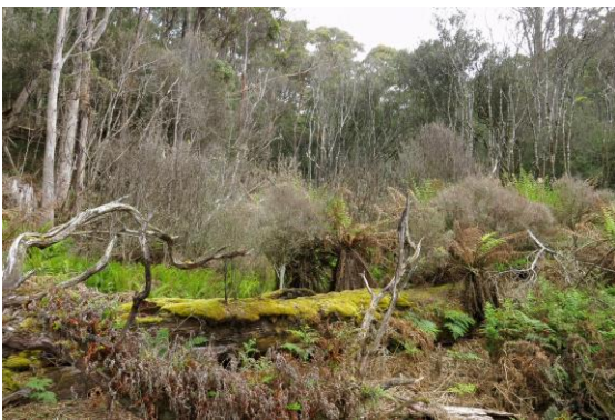
Salt necrosis from storm surge

Some of the party chose to eat lunch at this rocky beach. As we climbed the next ridge we found the partly eaten corpse of a Little Penguin on the track. A deposit of bird lime beneath a nearby tree marked a likely spot for a raptor to have been on watch.