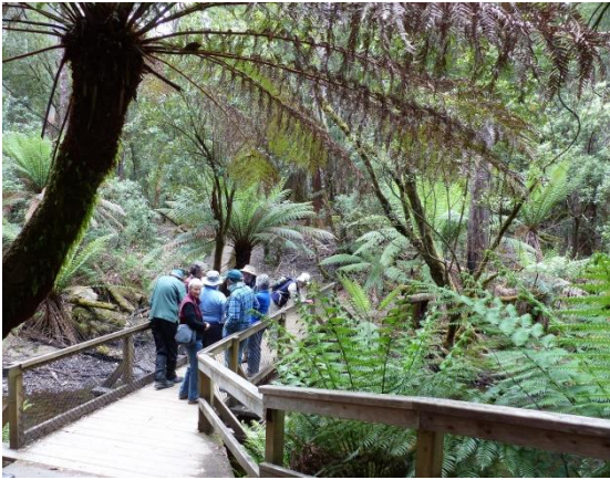
Looking for a platypus on the Russel Falls track