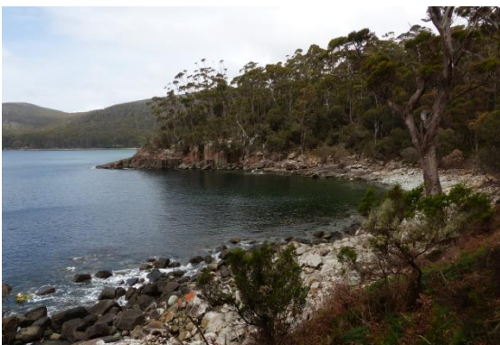
Coastline between Fortescue and Canoe Bay

There was evidence of penguin tracks high above foreshore, marked by flattened ground and an abundance of liverwort growing where perhaps the other vascular plants had been discouraged by the pattering of little feet. There were also several burrows, and it appears there is a reasonably large penguin population there.