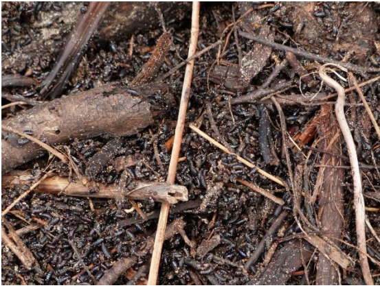
The mass of expired fly pupae