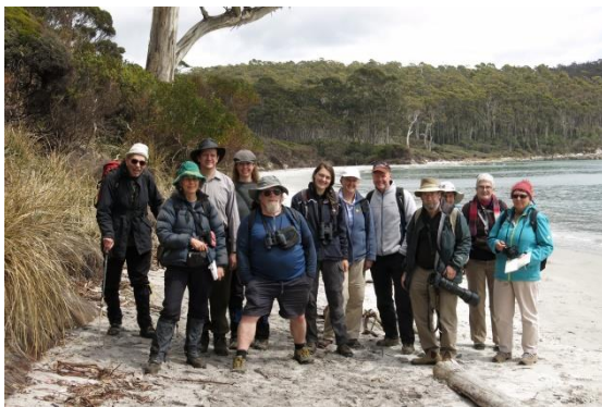
On Fortescue Bay beach at start of walk