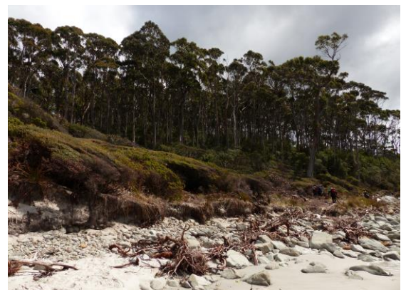
Erosion at Fortescue Bay

As we proceeded along the beach, turning over debris, we noticed a very agitated Pied oystercatcher which was disturbed by our presence. These birds are almost always seen in pairs, and we soon spotted the other one, sitting on a nest on an eroded dune shelf.