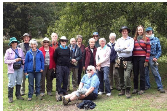
At the Christmas BBQ

Before putting our snags on the barbie, most of us walked up to Russell Falls, scanning the creek for platypuses (not seen) and the shaded banks for orchids and birds -several species of orchids were seen as well as a pair of pink robins.