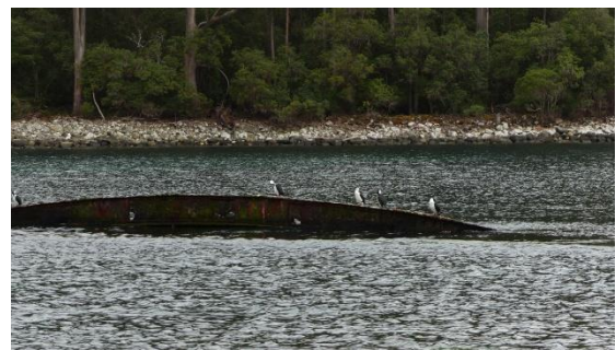
The hulk of The William Pitt makes a roost for Black-faced cormorants

The track continues to Bivouac Bay, and the walk from Fortescue to Bivouac is about 5km, a 3 hour return walk according to PWS website. TFN pace is however more leisurely and we managed to fill in the day pleasantly by going only part way.