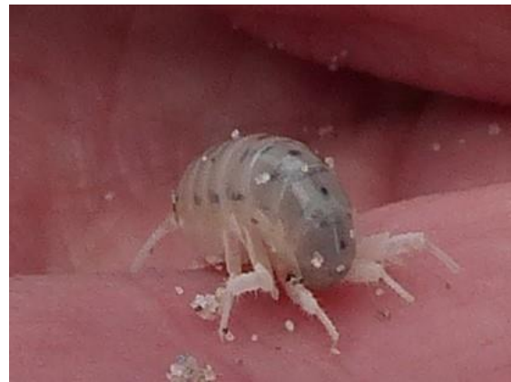
Sandhopper of unknown species