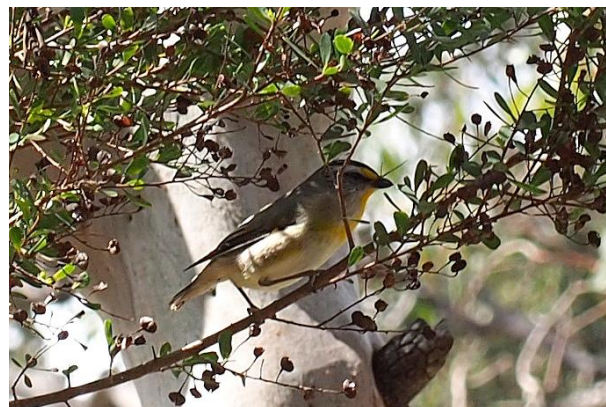
Striated pardalote

The record of the Yellow-tailed Black Cockatoo has to be considered a first for the Tasmanian Bushland Gardens, the species not having been recorded on any of seven previous lists dating back to 2004.