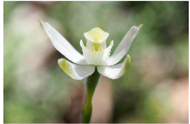
White Caladenia gracilis .

members of the "pink fingers" group. It would be nice if we could actually find more of it to test this! Meanwhile, orchid-watchers should be alert to the possibility of sylvicola -like colour forms of various Caladenias showing up.