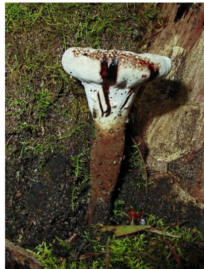
Amauroderma rude.

Deep in the valley the creek was running fresh from rain. We crossed it twice on the little bridges. Ferns, moss,