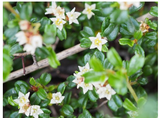
Spyridium obcordatum .