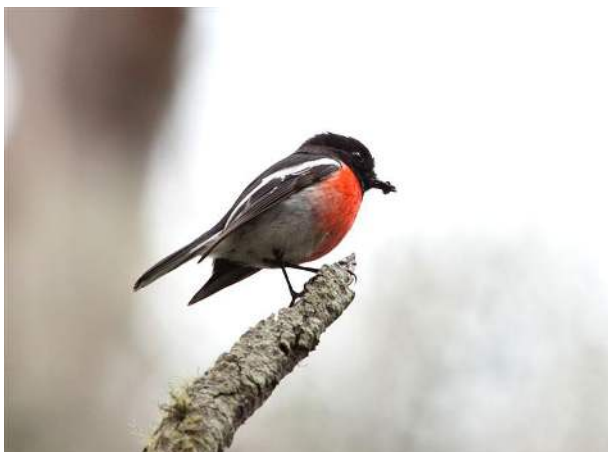
Scarlet robin (male).