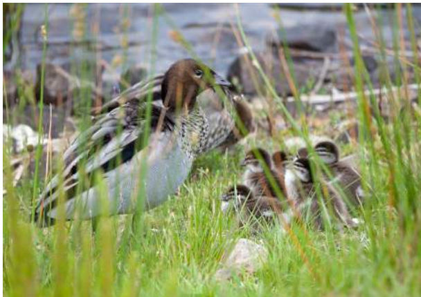
Wood duck with young.

Walking back on the far side of the reservoir we could see pacific gulls gathering in a large group out on the water, ducking and bobbing, bathing in the afternoon sun. A family of wood duck paddled on the waters edge, with six little ducklings darting about. Black ducks and coots and one hoary-headed grebe were also out on the water.