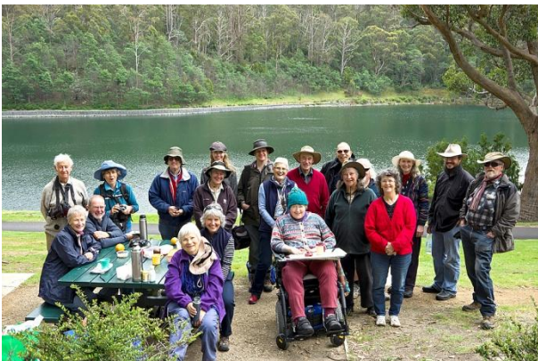
Field Nats group at the Waterworks.

The weather was fresh and sunny and members enjoyed their lunch while pardalote, thrush and cuckoo serenaded overhead. On the reservoir pacific gulls and ducks enjoyed the sunshine. With easy road access we were delighted to be joined by Julia and she accompanied us along the road to the start of the track.