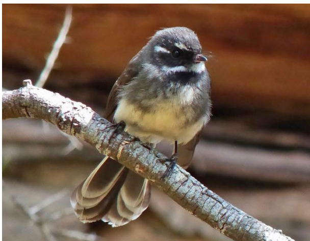
Grey fantail.

The following birds were observed (list contributed by Vern Hansson):