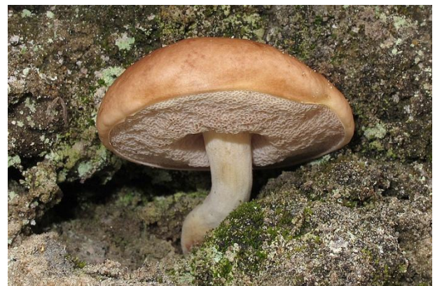
Fistulinella mollis.