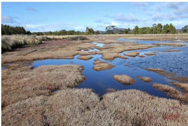
Race Course Flats.

Race Course Flats Saltmarsh is a quite spectacular marsh-like area with ponds and some Juncus sp. Sarcocornia sp., Disphyma and bare ground.