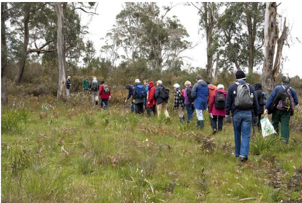
A guided tour of Rubicon Sanctuary.

http://www.disjunctnaturalists.com/articles2/spyridium-obcordatum.pdf