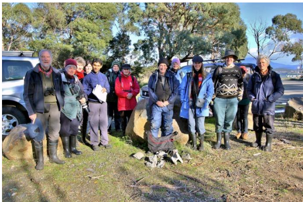
Field nats group at Lauderdale.

Though cold, the weather was kind to the 14 members who attended.