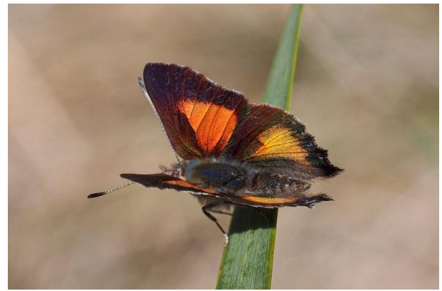
Paralucia aurifer (Bright Copper)

The bright copper is regarded as common but local, restricted to areas where its food plant ( Bursaria spinosa ) grows.