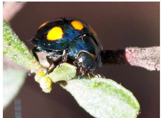
Orange-spotted ladybird ( Orcus australasiae )