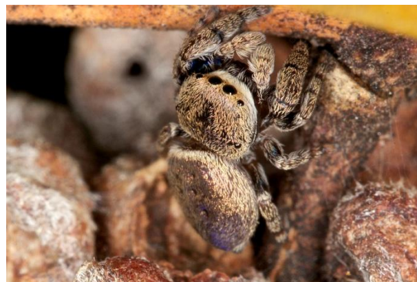
Pygmy Jumping Spider.

Interesting finds were lots of spiders at the Dorans Road site, orb webs full of tiny flying insects; a Polychete worm found by Geoff Fenton; caterpillar; Geometrid moth in the more treed area on the boundary; Common Froglet and small jumping spider.