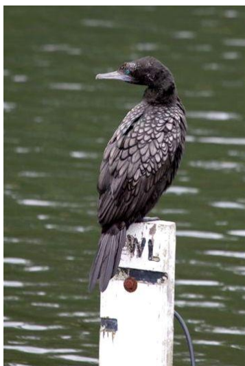
Little Black Cormorant.

The last of the group to return finished up with a cuppa, with masked lapwing calling and the spotted pardalote reaching his gentile, clear high notes.