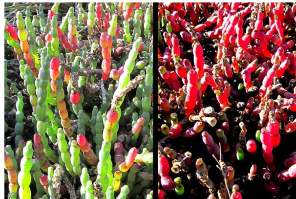
Sarcocornia blackiana .

We spent a fascinating day inspecting an important vegetation type we tend to overlook.