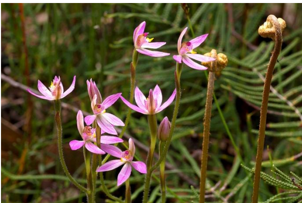
Caladenia alata at Rubicon Sanctuary.