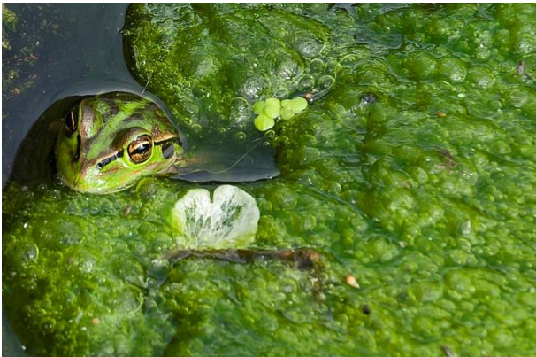
Green and gold frog at Hawley House.