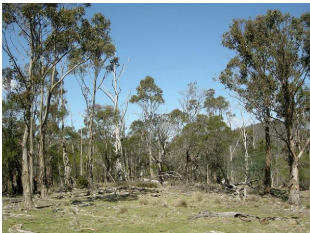
Dry sclerophyll forest.