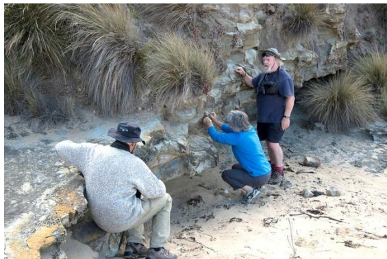
Looking for Bristletails.

of the place and decided to have morning tea on the headland.