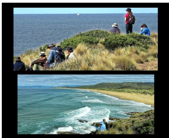
On the headland at Calverts Beach.

Whilst there, we were treated to a close fly-over by a juvenile Wedge-tailed Eagle. With our cameras NOT at the ready, we all pretty much missed the opportunity for a fabulous shot.