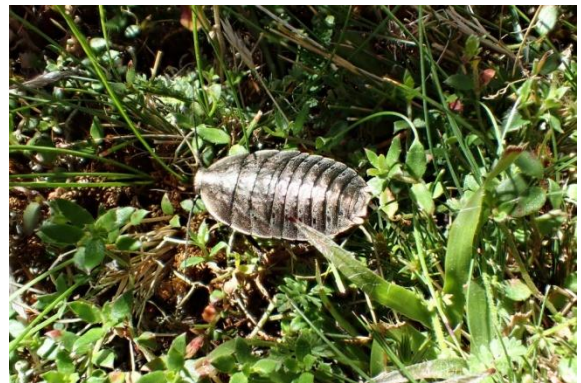
Golden cockroach .

We also turned up Castiarina rudis and the locally restricted Golden Cockroach near Lake Ada.