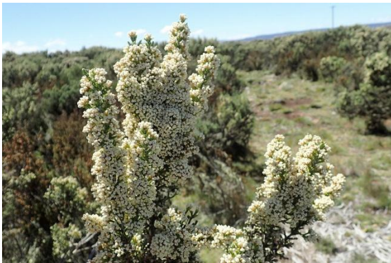
Ozothamnus hookeri.

The backstory is that this beautiful species was collected twice in the 1940s, described, but not recorded again for more than 50 years. Thus it was officially extinct at that time but then the odd dead specimen started to turn up. Our first club excursions were exploratory but based on inferred biology of the species. For the first couple of years we were unsuccessful, although a valuable result was the finding of another rarity, Castiarina rudis , at Lake Augusta. Then, in 2013, we discovered Mienna Jewel Beetles in large numbers at Liawennee initially, and subsequently over a range of tens of kilometres from there. Our strategy had been to vary our excursions in time over the January/February period thought to be the adult flight season for the species. These results were reported in the 2013 Tasmanian Naturalist . In 2014 we again searched for the species but despite now knowing its host species, the daisy bush Ozothamnus hookeri , we were unable to find it. Several jewel beetles and other insect species are known to appear only at multi-year intervals, but clearly mystery was still involved.