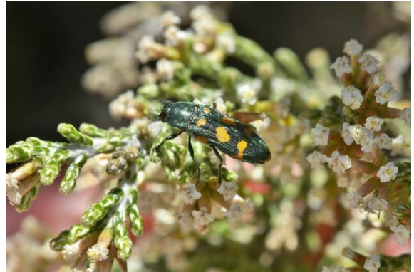
Mienna jewel beetle (Castiarina insculpta)

So, on a bright sunny day, ideal for adult jewel beetle activity, eight of us set out. By now we are using the Lake Augusta Rd turnoff at Liawennee, the site of our 2013 discovery, as our reference location. We arrived there greeted by the bright blossoms of many daisy bushes and within a few minutes had again found numerous Mienna jewel beetles. We had been encouraged by earlier reports of sightings this summer and were not disappointed. The mystery has become; will Mienna jewel beetles appear consistently at two year intervals into the future?