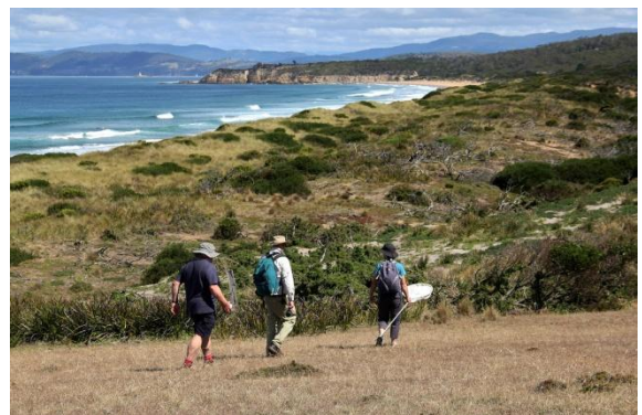
View across Calverts Beach to Iron Pot.

Photographic contributions to the record of the day's activities can be posted to Flickr – Tag "2015_Mar_Calverts_Beach". These can all be seen on the Club web site "2015-excursions" page.