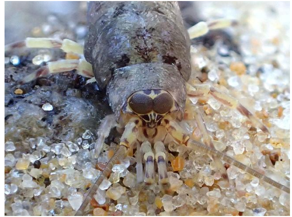
The "face" of a Bristletail.

Greg went another 50 meters away from the main find and managed to locate another Bristletail. Beth captured a close up photo of its "face" and a bit of video as well.