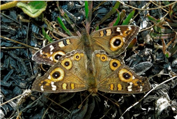
Meadow argus Junonia villida.

While up on the headland, we saw a smaller cove on the other side, which we decided would be a good spot to continue our search for Bristletails.