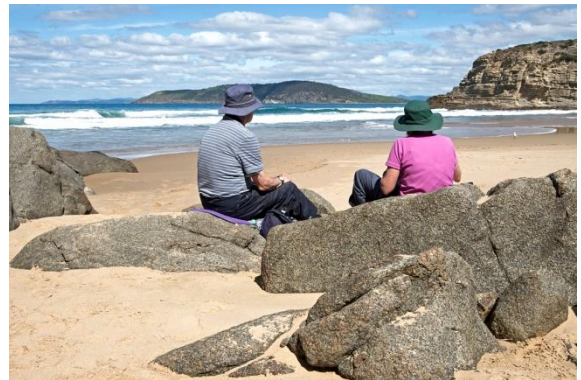
Lunch on the beach.