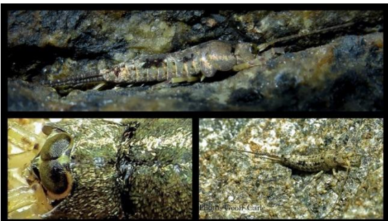
Bristletails ( Allomachilis froggatti ).

At the far end of the cove we struck it rich with a very productive "colony" of Bristletails hiding in the crevices in the rocks quite close to the water's edge. Finding proved to be much easier than photographing but a very determined Geoff Carle eventually got some good shots of the uncooperative little critters.