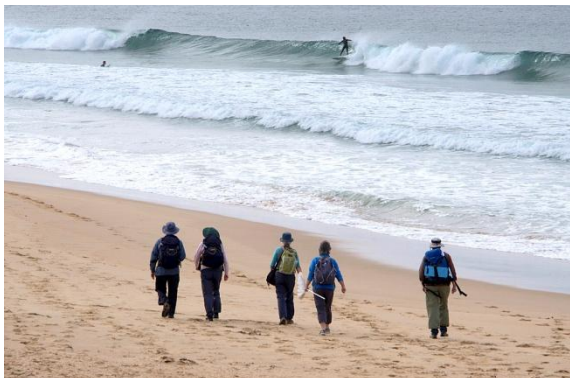
Field Nats on a mission.

On a perfect Tasmanian Autumn day, 13 enthusiastic Field Nats set out for a day on Calverts Beach hoping to find some Bristletails. The temperature was mild, the wind light and the surf was up! We saw many surfers enjoying the great waves as we walked along to our first hunting ground at the North East end of the beach.