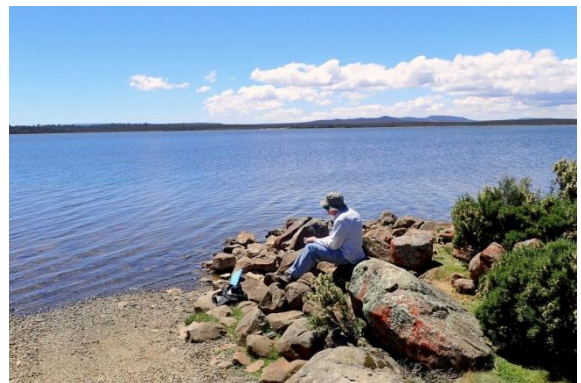
Relaxing at Lake Ada.

This activity has to some extent assumed project status. In future years we will be looking for further evidence of episodic appearance of Mienna jewel beetles and more details of its life history. We may overnight at Mienna to allow more exploration time on the plateau.