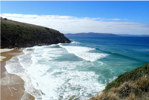
The Cove.

While up on the headland, we saw a smaller cove on the other side, which we decided would be a good spot to continue our search for Bristletails.