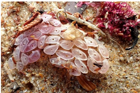
Empty egg capsules ( Dicathais orbita ).

Despite much poking in cracks in the rocks with bits of grass, the Bristletails remained elusive at this site. However, not to be deterred, we climbed the headland to enjoy the marvelous views and move towards our next hunting ground. We were distracted by the majesty