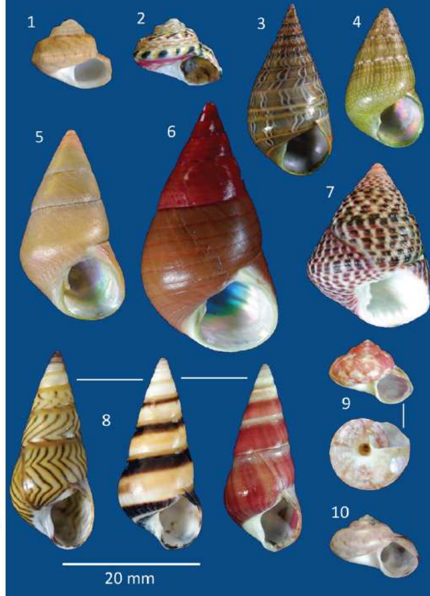
Plate 15 – Top-shells (part c)

10. Ethminolia probabilis Iredale, 1924 May's top-shell . 10 mm. Very similar to E. vitiliginea , but umbilicus relatively broad. Lives subtidally among seaweed and seagrass. Rare in Tas., and largely confined to the N coast and Bass Strait islands; most likely to be found towards the NE. NSW, TAS and VIC.